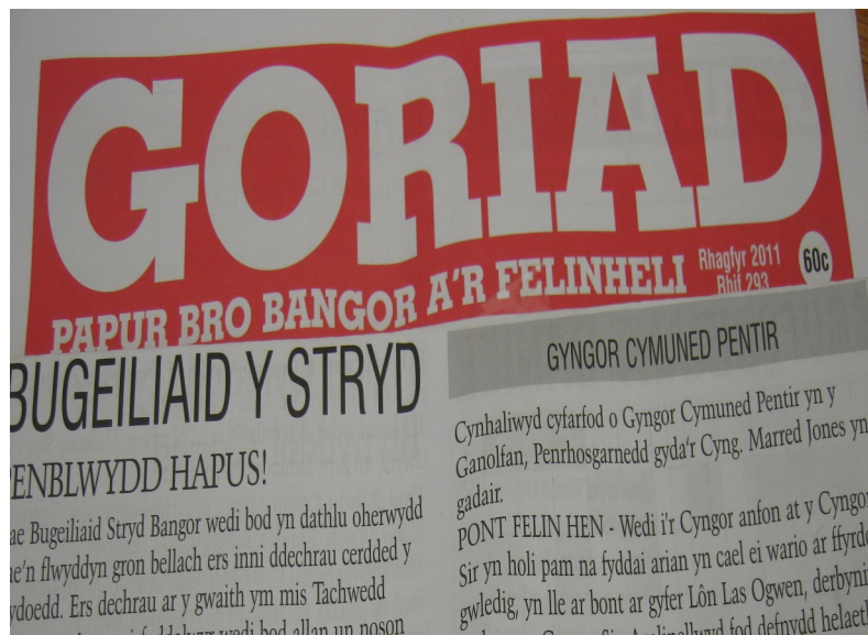
'Bugeiliaid y Stryd' (Street Shepherds) are a group of volunteers from churches in Bangor. They stay out overnight to help people in need.