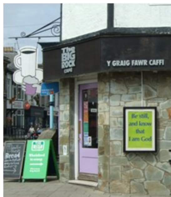
Christians in the Porthmadog area are responsible for 'The Big Rock Cafe'.