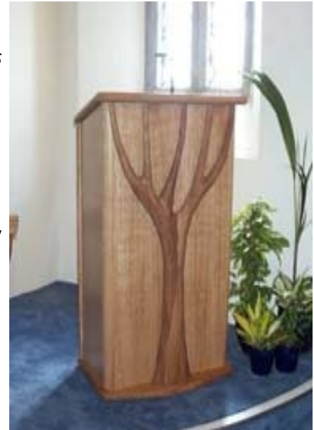
Colin Pearce used the theme 'Tree of Life' on the furniture in Llanfaelog Church, Anglesey.